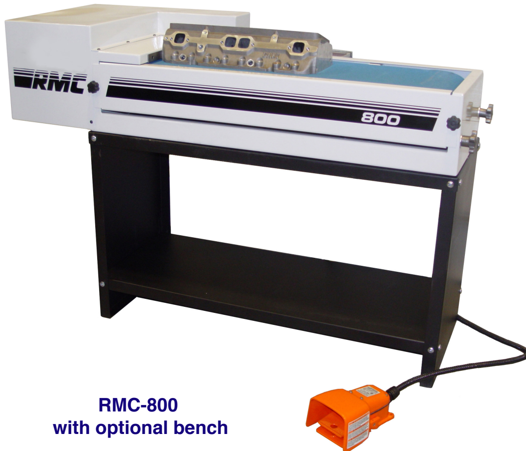
RMC-800 with optional bench

RMC's Belt Resurfacers are rugged and versatile machines that are designed to substantially reduce resurfacing time and labor costs. These high quality Belt Resurfacers have been proven effective time after time in rebuilding facilities all across the United States. RMC Belt Resurfacers will deliver years of dependable and productive resurfacing service to any size shop for dry resurfacing of aluminum heads, intake manifolds, cast iron exhaust manifolds, small cylinder heads, gasket surface areas, covers and pans and a multitude of other small parts.