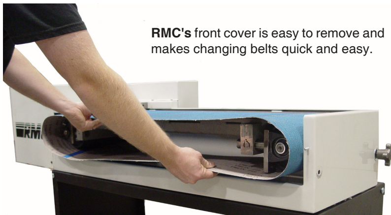
RMC's front cover is easy to remove and makes changing belts quick and easy.

RMC offers Zirconium and Silicone Carbide replacement belts for our resurfacers in 40, 60, 80 and 120 grit.