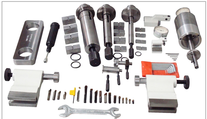
Standard Equipment Package