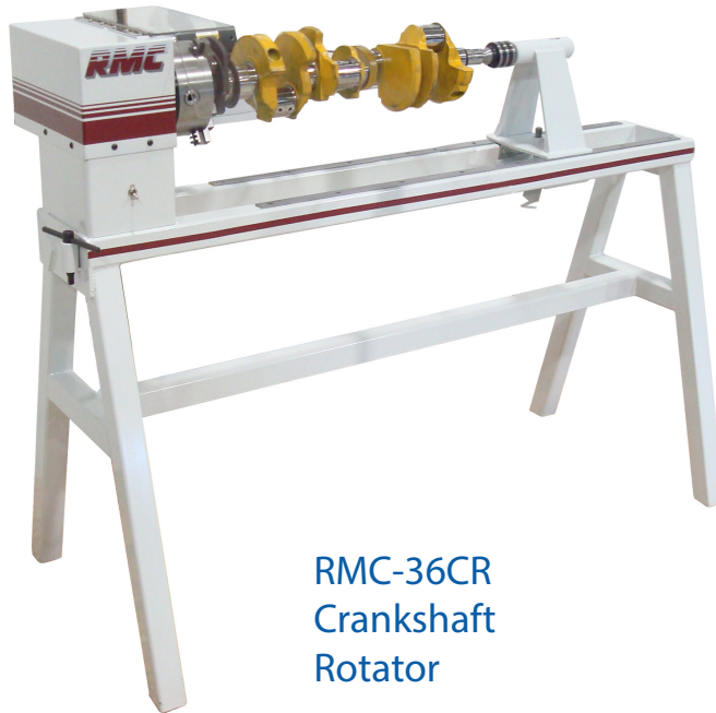
RMC-36CR Crankshaft Rotator