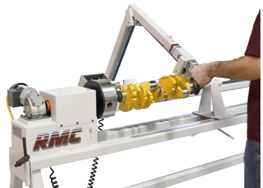
Attached Arm polisher

In order to bring you the most advanced features as soon as possible, all features, descriptions and technical specifications are subject to change.