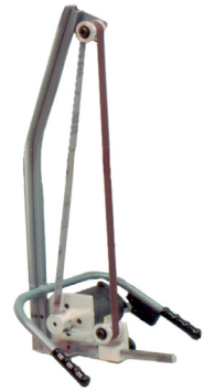
Hand held 1/2 HP 10,000 RPM Polishing Machine